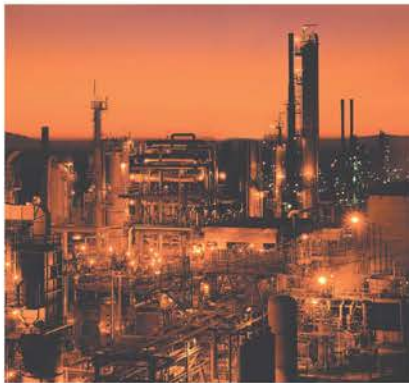
Industry and Building Automation

Clorius Controls offers a large program of conventional regulation actuators and analogue actuators. This includes special actuators for maritime use, which are designed to withstand vibrations.